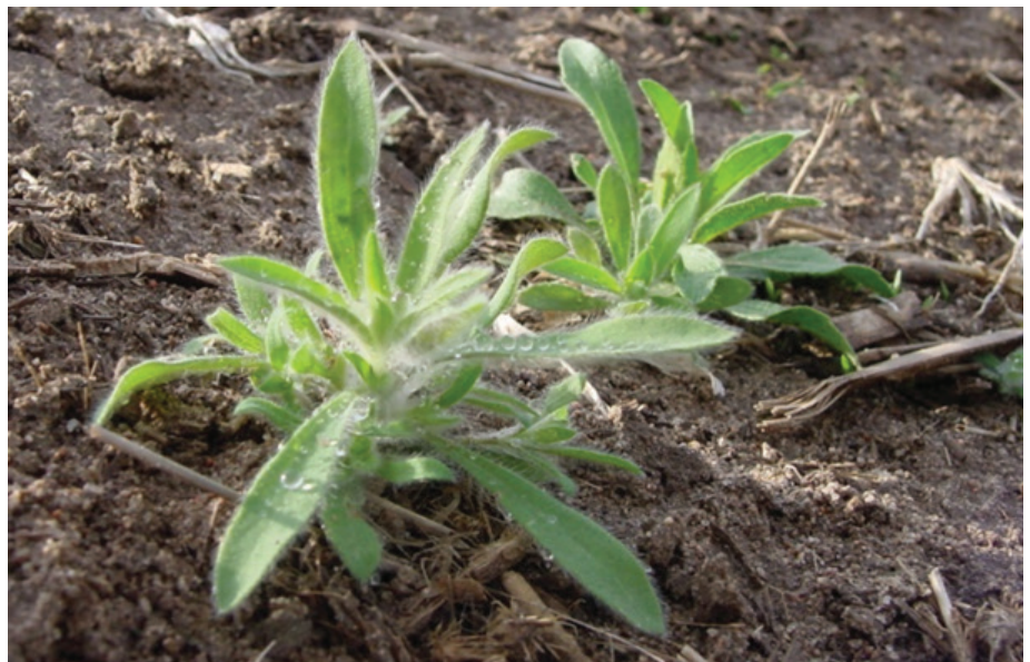
Figure 3. Kochia seedlings in early spring.

Kochia emergence starts as early as mid-March in central Kansas and by late