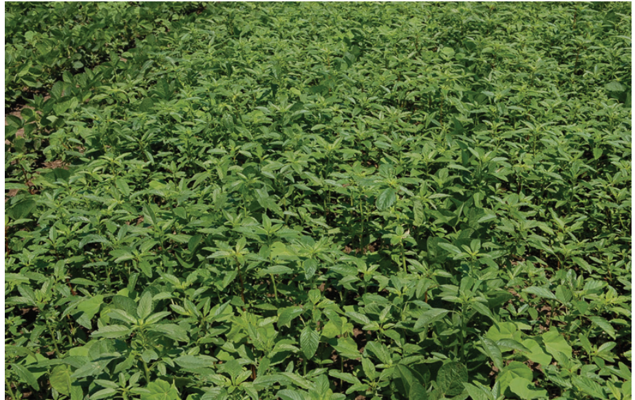
Figure 1. Common waterhemp competition in a soybean field.

Common waterhemp populations resistant to triazine and acetolactate synthase (ALS)-inhibiting herbicides are common in Nebraska due to a widespread and a repeated use of ALS-inhibiting herbicides (Pursuit, Classic, FirstRate) and atrazine (AAtrex®). A common waterhemp population from a native-grass seed production field in southeast Nebraska has been reported as resistant to 2,4-D. The dose response study confirmed that the waterhemp biotype was 10-fold