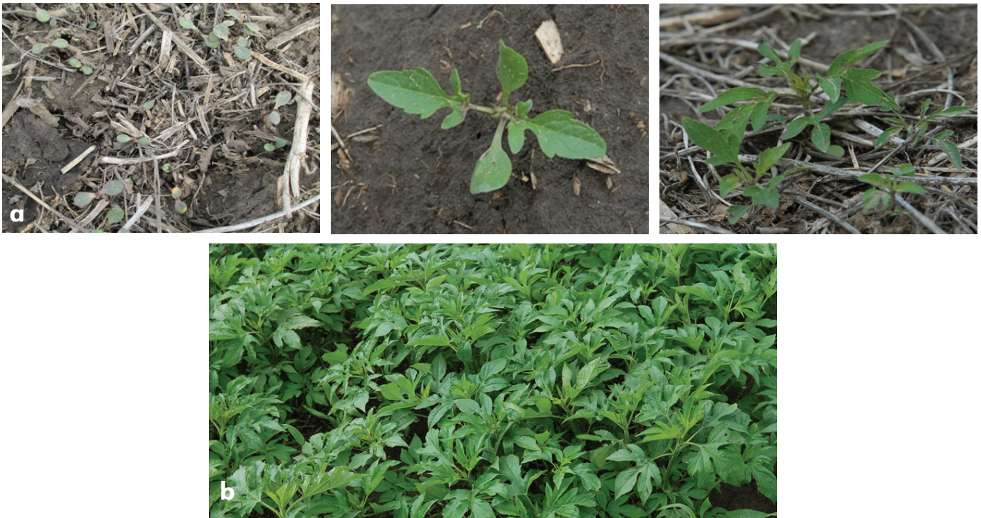
Figure 2. Giant ragweed seedlings in a field at Clay Center, Nebr. (a). Glyphosate-resistant giant ragweed in a field near Clay Center, Nebr. (b).

populations were from fields with corn-soybean rotations and with history of repeated use of glyphosate. There have been confirmed reports of multiple-resistant giant ragweed to glyphosate and ALS-inhibiting herbicides in Ohio and Minnesota.