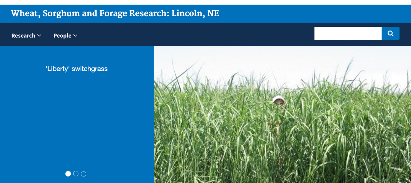
ARS Home | About ARS | Contact Us