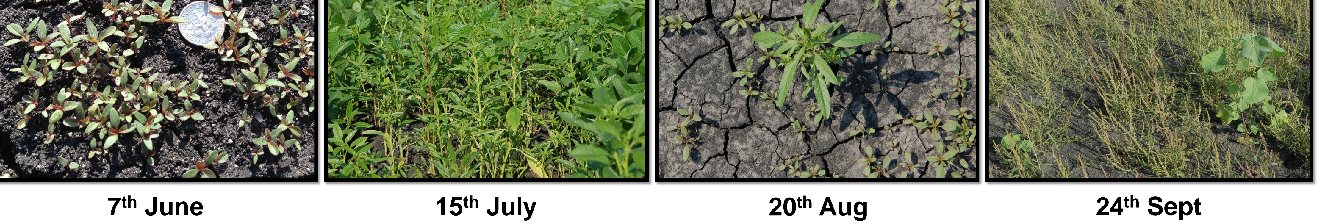
Figure 1: Extended emergence period of common waterhemp

• Several very long chain fatty acid (VLCFA) inhibitors have been registered for sequential applications in soybean; however, limited information is available on season-long control of glyphosate-resistant common waterhemp with sequential-applications of VLCFA inhibitors.