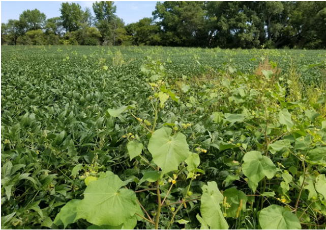
Figure 1. Velvetleaf escape after dicamba applied POST in dicamba/glyphosate-resistant soybean in south central Nebraska.

biennial, and 65 perennial broadleaf weeds (Anonymous 2020). Growers rely on dicamba for POST broadleaf weed control, including control of glyphosate-resistant Palmer amaranth ( Amaranthus palmeri S. Watson) in DGR soybean (De Sanctis et al. 2021); however, velvetleaf escape has been observed where dicamba was the only herbicide applied POST (Figure 1). Murphy and Lindquist (2002) reported poor control of velvetleaf with dicamba at 318 g ae ha -1 under field conditions. Hart (1997) reported 87% velvetleaf biomass reduction with dicamba at 140 g ae ha -1 + halosulfuron-methyl at 9 g ai ha -1 . Herbicide efficacy can be affected by velvetleaf plant height. Knezevic et al. (2009) reported 84% and 68% velvetleaf control with glyphosate at 1,059 g ae ha -1 when plants were 12 cm and 25 cm tall, respectively, at the time of glyphosate application. Ganie and Jhala (2021) reported velvetleaf density of 1 plant m -2 with glyphosate at 1,060 g ae ha -1 applied to 8- to 12-cm-tall plants compared with 7 plants m -2 in the nontreated control.