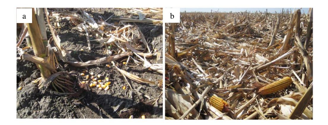
Figure 3. Improperly adjusted combine harvester leads to harvesting losses in maize as a) individual seeds (left) or b) full ears (right).