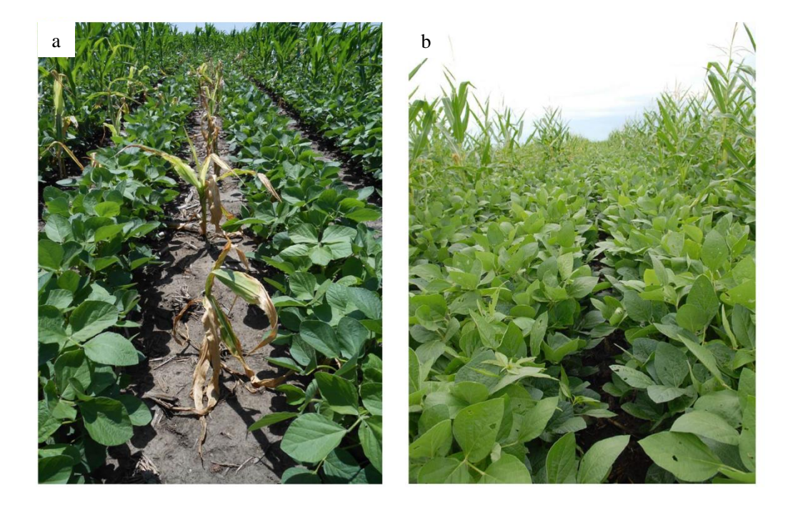
Figure 4. Control of glyphosate-resistant volunteer maize at a) 15 d after early- (left) and b) late-POST application (right) of glufosinate (450 g ai ha<sup>-1</sup>).

Figure 3. Improperly adjusted combine harvester leads to harvesting losses in maize as a) individual seeds (left) or b) full ears (right).