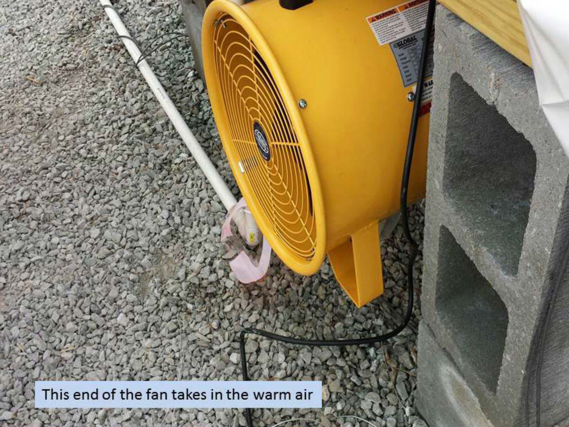
This end of the fan takes in the warm air