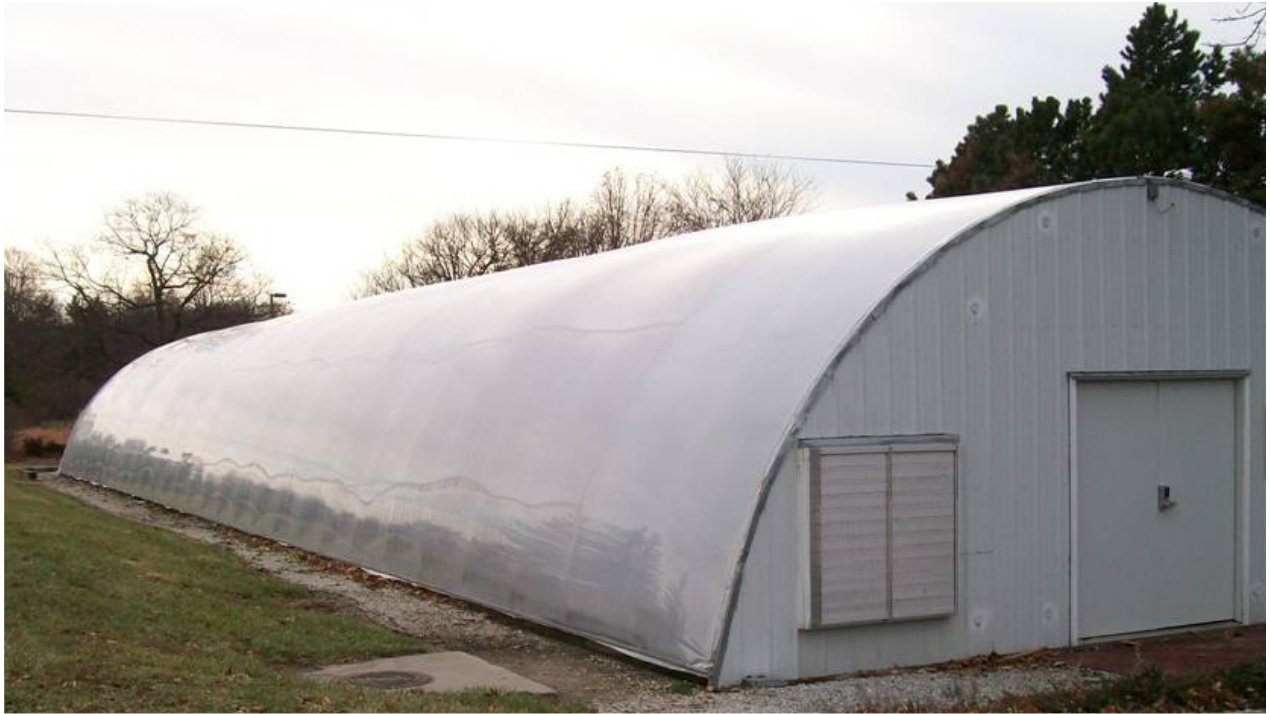
Figure 1. Double poly Quonset-style greenhouse with solid north end wall.