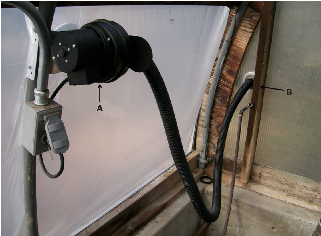
Figure 3. Small squirrel cage fan (A) taking outside air in (B) and blowing it between the layers of polyethylene.