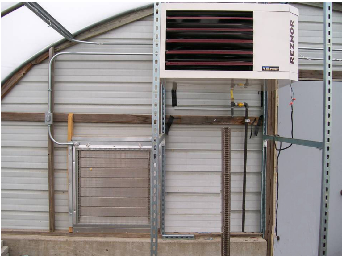
Figure 4. Interior of greenhouse north wall with exhaust fan (lower left) and furnace (upper right).