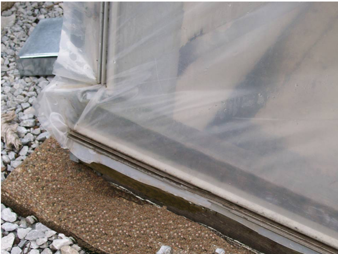
Figure 2. Close-up of solid cement footing into which structural posts are set. A 2-by-6-inch board is affixed to the posts, and polylock is attached to the board.