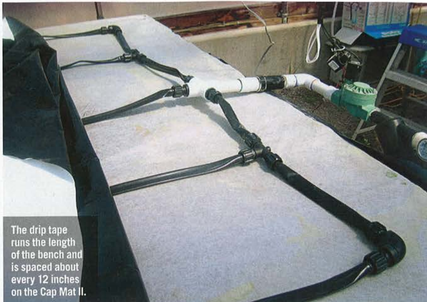
The drip tape runs the length of the bench and is spaced about every 12 inches on the Cap Mat II.

The drip tape runs the length of the bench and is spaced about every 12