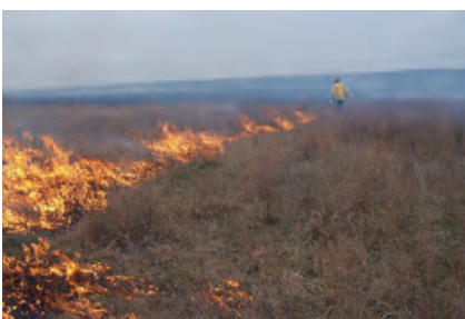
High-intensity fires carry well in high-quality grassland with adequate fuel-loads.

Grassland degradation has resulted from a history of suppression of natural fire, elimination of human-caused fire, and overgrazing by livestock. Two species of native juniper ( Juniperous ashei and J. virginiana ) readily encroach on grasslands when fire has been excluded, creating a juniper woodland system. Fire is often ineffective as a restoration tool in grasslands that have transitioned to juniper woodlands. This is because juniper cover and overgrazing have removed the herbaceous layer needed to support the fire intensity required to kill junipers.